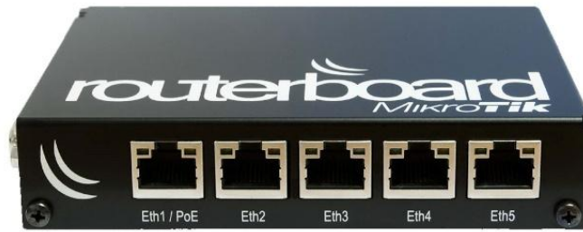
Figure 2. Mikrotik Router Board