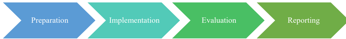
Figure 1. Stages of Community Service Implementation