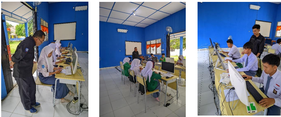
Figure 4. Implementation of Training