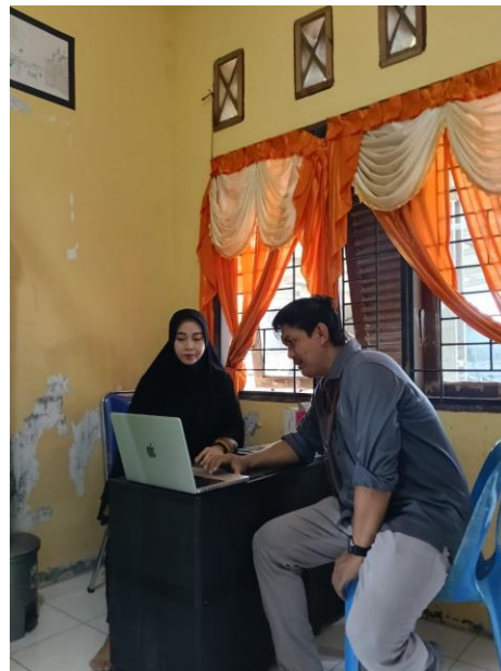
Figure 3. Trial use of the medicine distribution application with partners in Kasih Sayang Village.

The next stage was the trial use of the medicine distribution application carried out with partners at the activity site. This trial aimed to ensure that the designed application could be used by village-level users and was suitable for the operational needs of health aid distribution in the field.