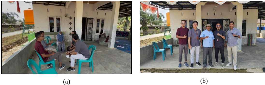
Figure 1. Initial visit by the community service team in Kasih Sayang Village, Manyak Payed District: (a) initial discussion and interview with village partners; (b) field coordination documentation with village officials.

the partner's condition, strengthen initial coordination with the village authorities, and identify the main needs related to the distribution of health assistance for flood-affected communities. In addition to direct observation and interviews, the needs identification process was also strengthened through the distribution of an initial questionnaire to partners to determine their perceptions of program urgency, system needs, and implementation readiness.