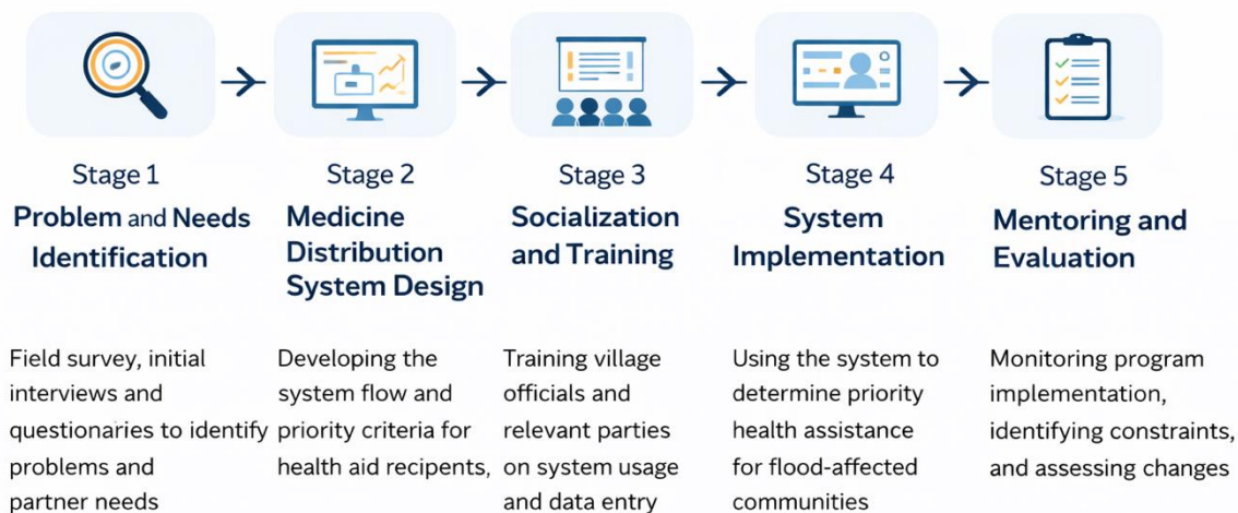
Figure 1. Stages of the Community Service Implementation Method

To provide a clearer description of the service implementation method, the stages of the community service activity are illustrated in Figure 1. This figure summarizes the sequential process used in the implementation of the medicine distribution system, starting from problem identification to mentoring and evaluation.